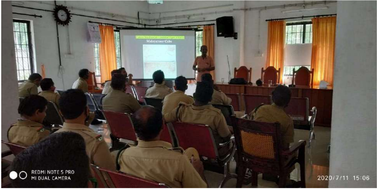
Camera trapping training in Malayattoor Division