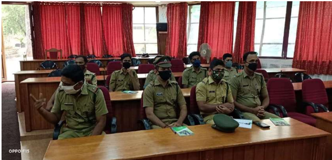
Training on arms and ammunition