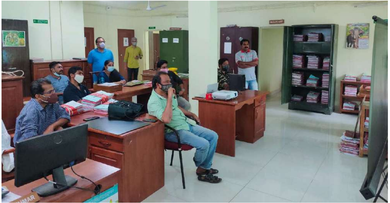
Training on KSR