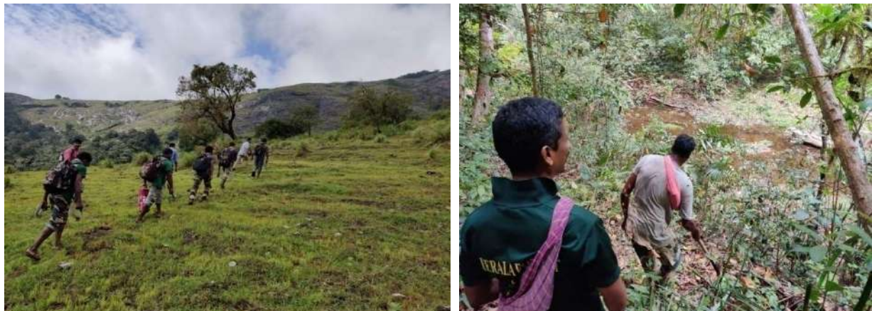
Field staff participating in the transect survey in Parambikulam Tiger Reserve

Transect survey was conducted to estimate the density of prey species in Parambikulam Tiger Reserve as a part of field exercises towards updation of Tiger Conservation Plan. It was a five-day programme that commenced from 24-01-2021 and completed on 26-01-2021. The survey was conducted only in the core area of Parambikulam. A total of 25 transects were selected for the survey with five replications of each transect. More than 100 field staff were participated for the survey. The survey was successfully completed and the result was submitted.