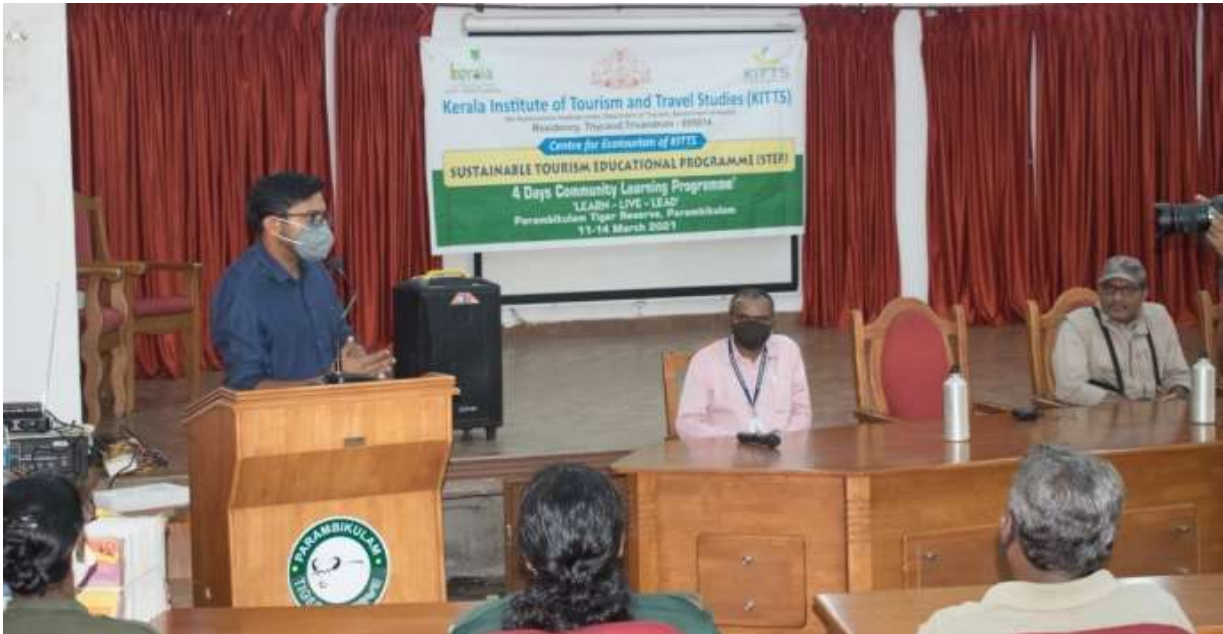
Training on Guiding skills and bird watching

PaTCoF conducted 4-day workshop in association with Kerala Institute of Tourism and Travel Studies on guiding skills and bird watching for 36 naturalists of Parambikulam Tiger Reserve. Sessions covered topics such as visitor management, guiding skills, knowledge on birdwatching, photography and interpretative skills. Class was conducted by the industry experts and faculty members of KITTS.