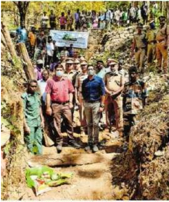
സാർവ്വതീയ മാനേജ്മെന്റ് പ്ലാൻ പ്രകാരം വടക്കൻ മേഖലയിൽ നിർമ്മിക്കുന്ന 100 ബ്രഷ് വുഡ് ചെക്ക്ഡാമുകളുടെ ഭാഗമായി പാറമീശ്ശേരിയിൽ 36 ചെക്ക്ഡാമുകളുടെ നിർമ്മാണം നടക്കുന്നുണ്ട്. ഇതിൽ 15 വീടുകളിൽ സഹായകരമായ വടക്കൻ മേഖലയിൽ 100 ബ്രഷ് വുഡ് ചെക്ക്ഡാമുകൾ നിർമ്മിക്കുക എന്ന ഉദ്ദേശ്യമുണ്ട്. ഇതിൽ 36 ചെക്ക്ഡാമുകൾ മാത്രം പൂർത്തിയാക്കിയിട്ടുണ്ട്.