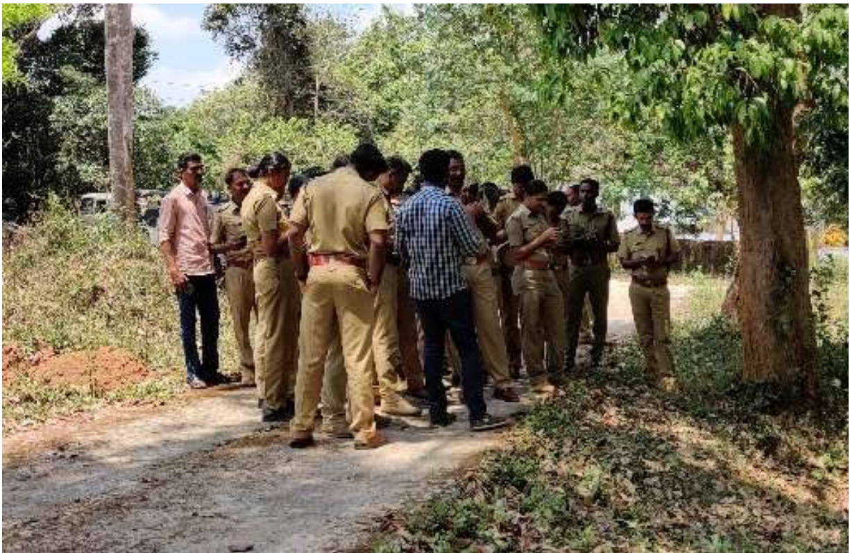
M-STriPES training session in Kannur

A training program on M-STriPES was conducted in Kannur Division on 04-08-2020 and South Wayanad Division on 06-08-2020. Section forest officers, Beat forest officers and watchers were the participants. About 30 participants from Kannur Division and 25 participants from Wayanad South Division were involved in the program. The sessions included installation of M-STriPES software in the computer and mobile phone, Field training on data collection, importing and analysis of the data collected from the field and finally, preparation of M-STriPES report.