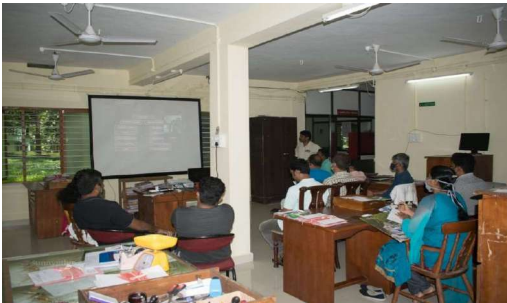
Training on MOP