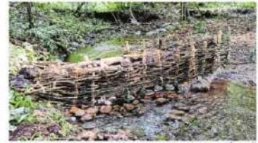
പാറമീശ്ശേരിയിൽ നിർമ്മിക്കുന്ന 36 ചെക്ക്ഡാമുകളുടെ ഭാഗമായി പാറമീശ്ശേരിയിൽ 36 ചെക്ക്ഡാമുകളുടെ നിർമ്മാണം നടക്കുന്നുണ്ട്. ഇതിൽ 15 വീടുകളിൽ സഹായകരമായ വടക്കൻ മേഖലയിൽ 100 ബ്രഷ് വുഡ് ചെക്ക്ഡാമുകൾ നിർമ്മിക്കുക എന്ന ഉദ്ദേശ്യമുണ്ട്. ഇതിൽ 36 ചെക്ക്ഡാമുകൾ മാത്രം പൂർത്തിയാക്കിയിട്ടുണ്ട്.

നീരാവറ്റങ്ങളെ ചാർജ്ജ് ചെയ്യാൻ ഉപയോഗിക്കുന്ന ചെക്ക്ഡാമുകൾ നല്ലതാണ്. ഇവയ്ക്ക് വെള്ളം നിലനിർത്താനും, അതിൽ വെള്ളം കെട്ടിനിർത്താനും സാധിക്കും. ഇതിൽ വെള്ളം കെട്ടിനിർത്താൻ സാധിക്കും. ഇതിൽ വെള്ളം കെട്ടിനിർത്താൻ സാധിക്കും. ഇതിൽ വെള്ളം കെട്ടിനിർത്താൻ സാധിക്കും.