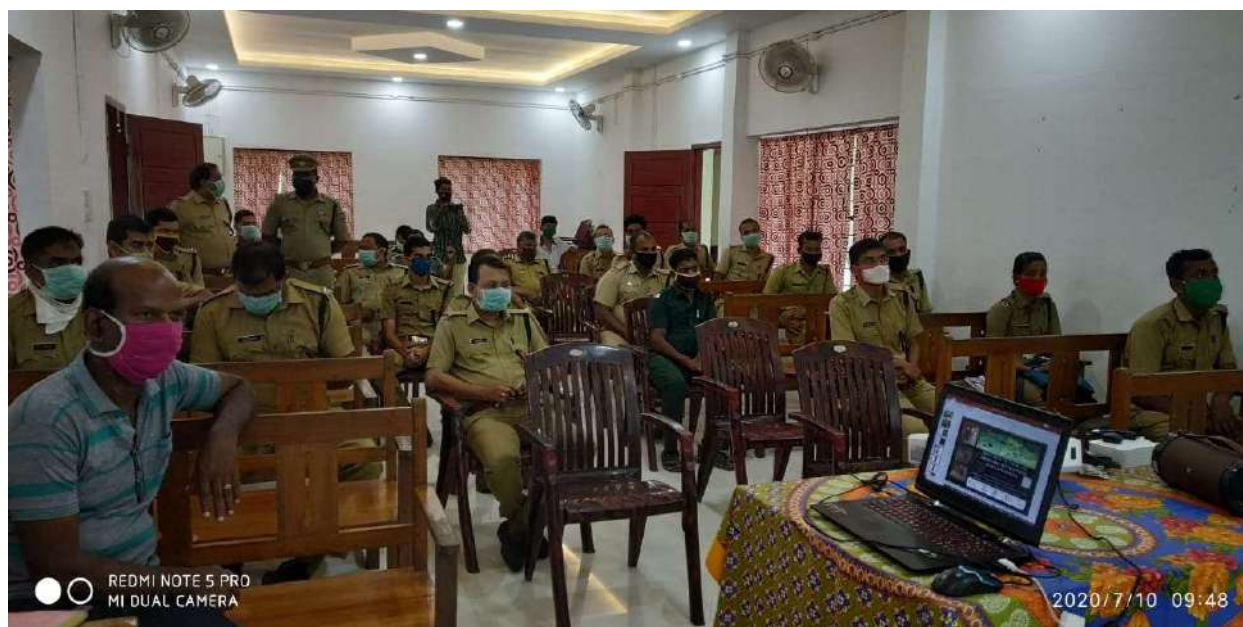
Camera trapping training in Chalakkudy Division

The training was conducted in Malayattoor Division on 11-07-2020. More than 60 participants were involved in the training. The classes were broken in two sessions in morning and afternoon by strictly following the COVID-19 protocol. In Vazhachal and Chalakkudy Division the training was conducted on 10-07-2020 morning and afternoon respectively. About 35 participants from Vazhachal division and 25 participants from Chalakkudy Division were involved in the training. Camera trap training was conducted in Parambikulam Tiger Reserve on 10 th and 11 th October, 2020 with more than 50 participants. The trainings were conducted in Tiger hall in Parambikulam and Nature study hall in Anappady for Orukomban, Karimala, Parambikulam ranges and Sungam Range respectively.