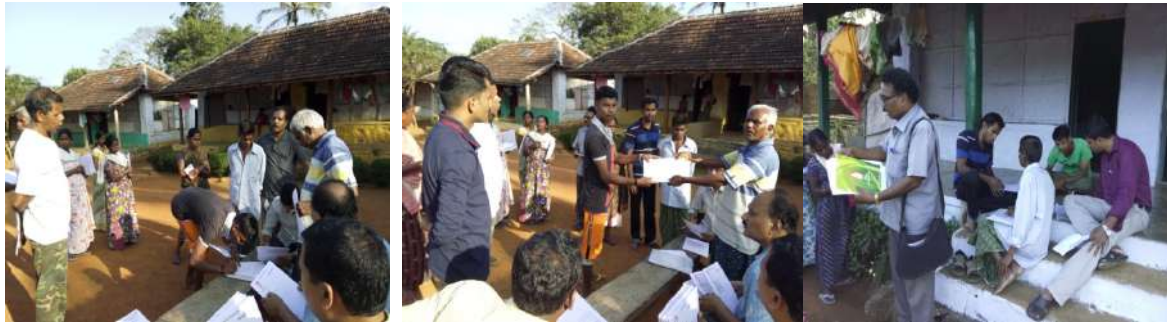
Postal people at work in Kuriyarkutty Colony